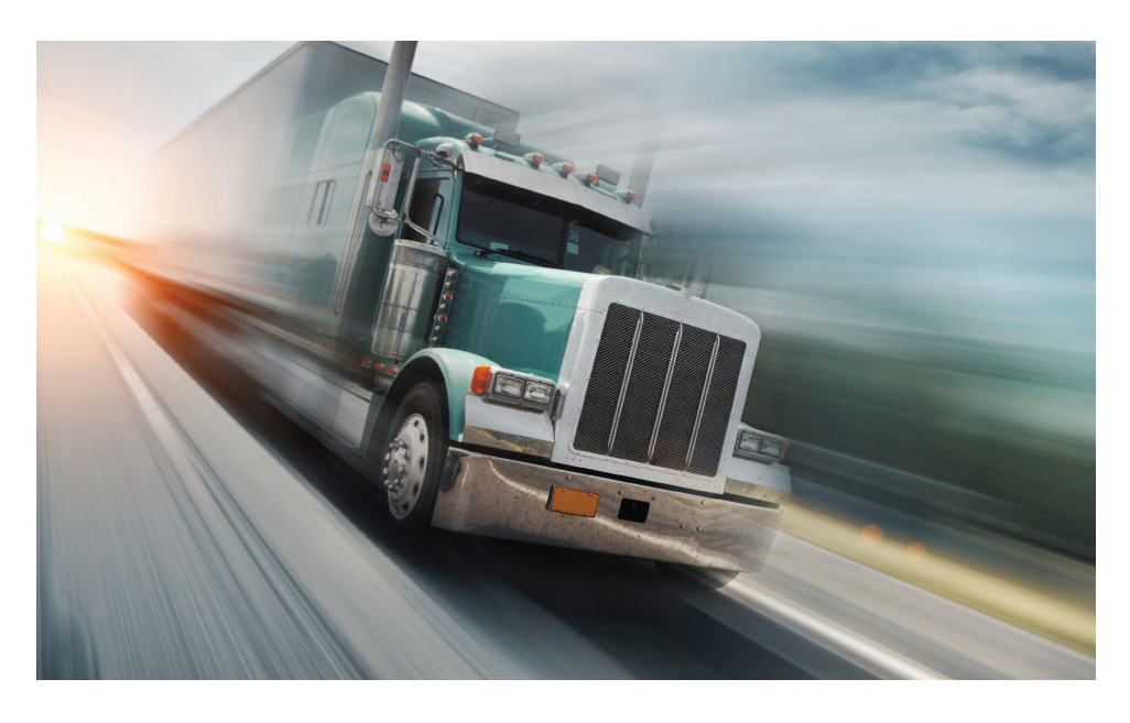
Blended to Formulate Mainline Heavy Duty Diesel Engine Oils