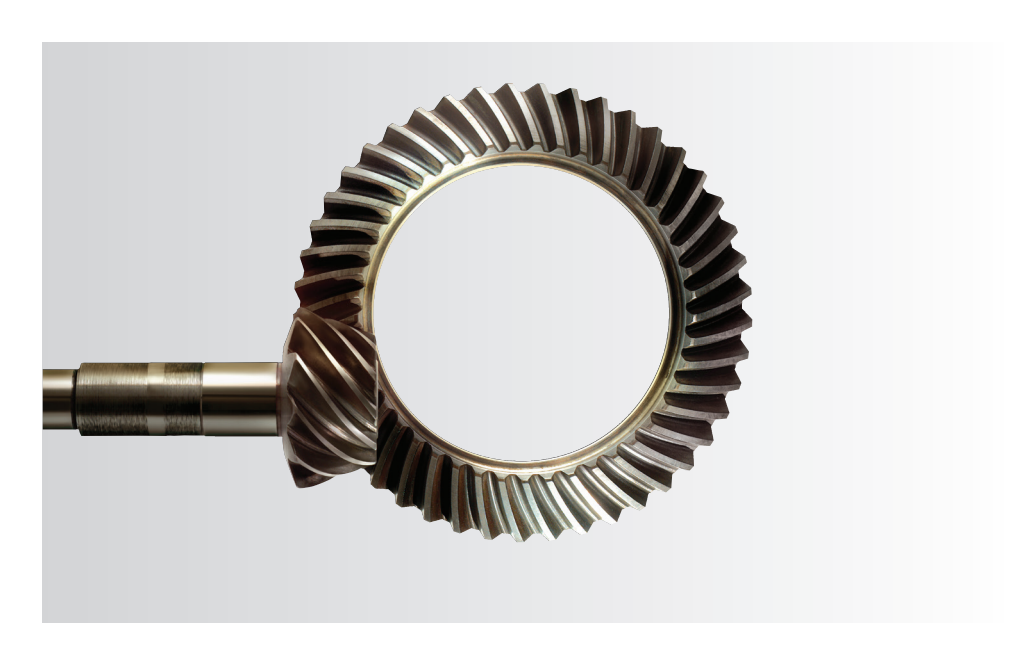
For Use in Light-duty and Heavy-duty Axles