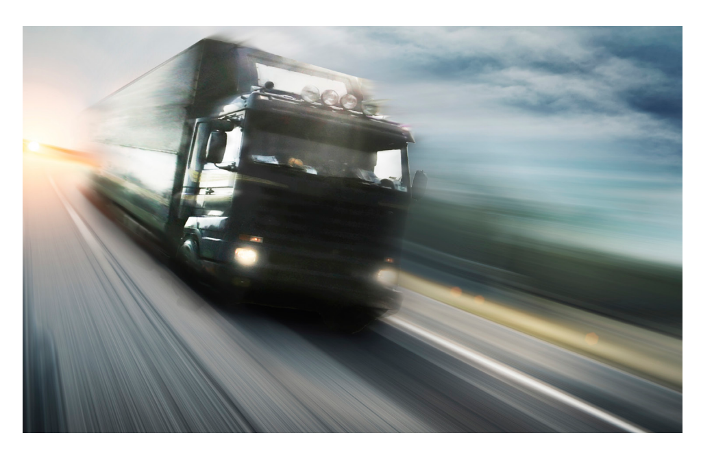
Global Top Tier Performance for Reduced SAPS Applications with Formulation Simplicity