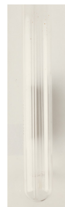
HiTEC® 317 additive