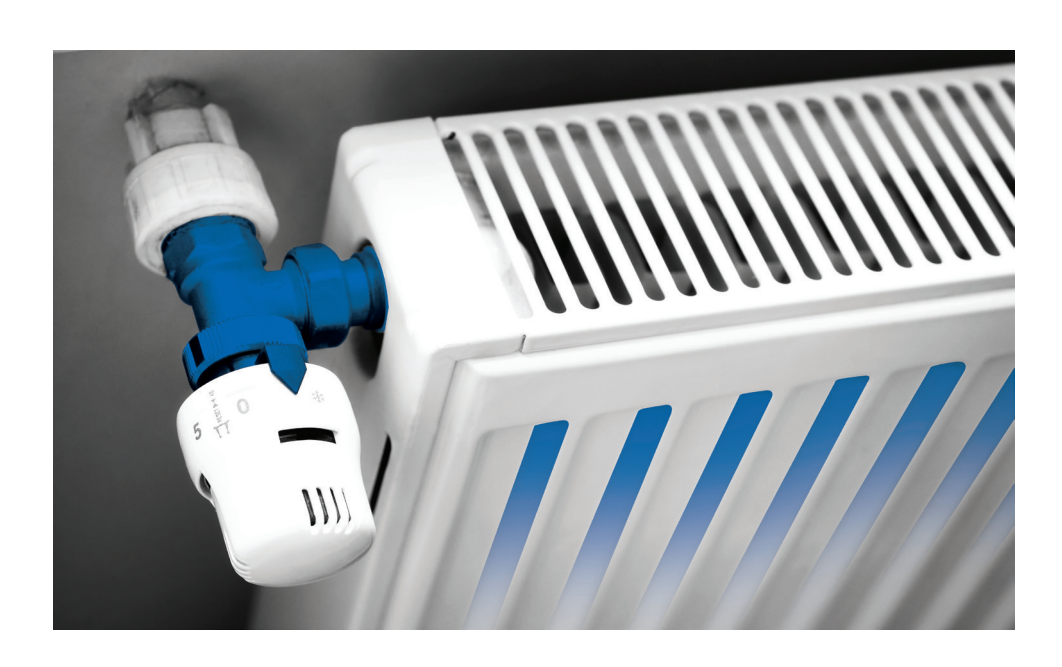
Supreme Ashless Heating Oil Additive For Modern Boilers