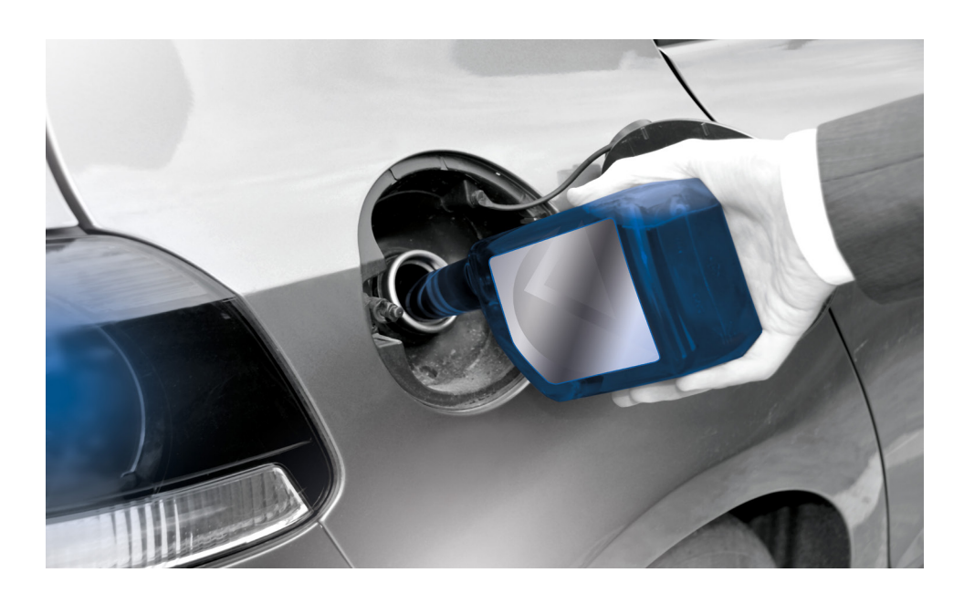
Multifunctional Aftermarket Additive Package for Diesel