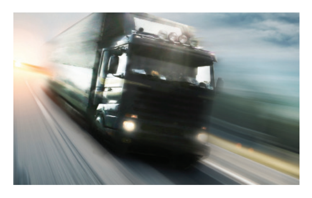
Designed to Cover API SG/SF/CF-4/CF/CD/CC Performance