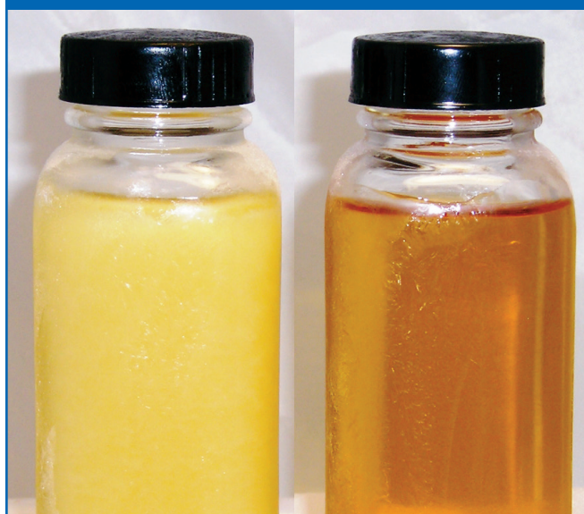
Appearance @ -20° C