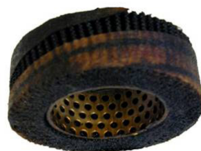
Competitor 1 in Group I ISO 46