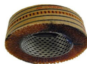
HiTEC® 543 in Group I ISO 46